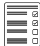
M&E Design Responsibility